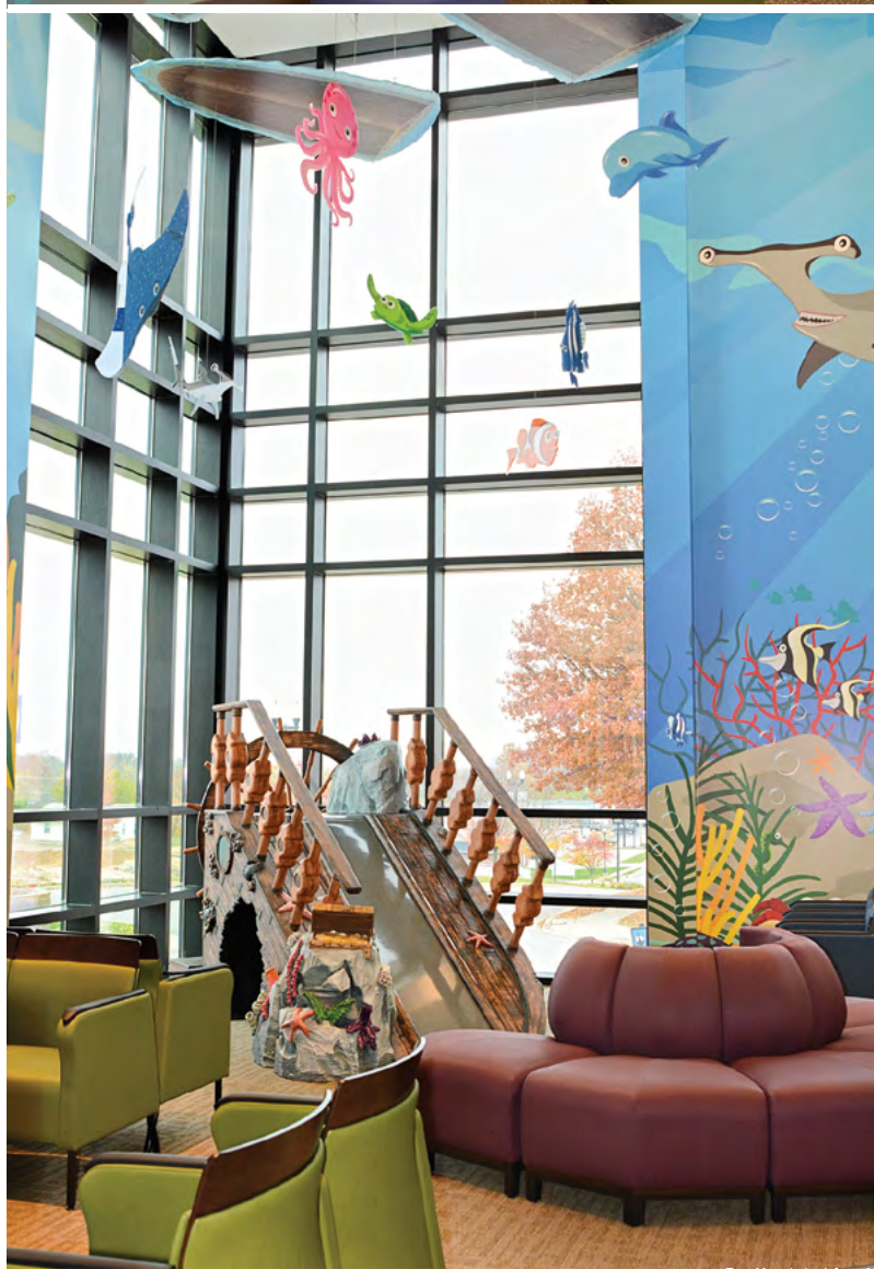
View of the kids' slide, tunnel, and hanging boats and sea creatures.