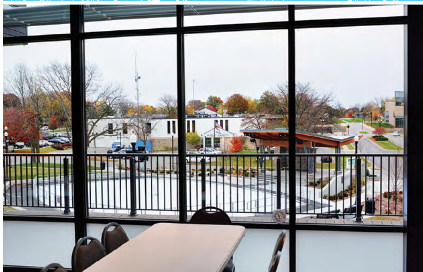
View of Gladstone's Linden Square from the employee lounge