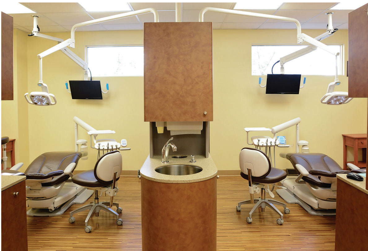
Left: Operatories Below: Flooring choices