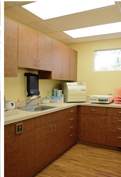
Left: Pan Area