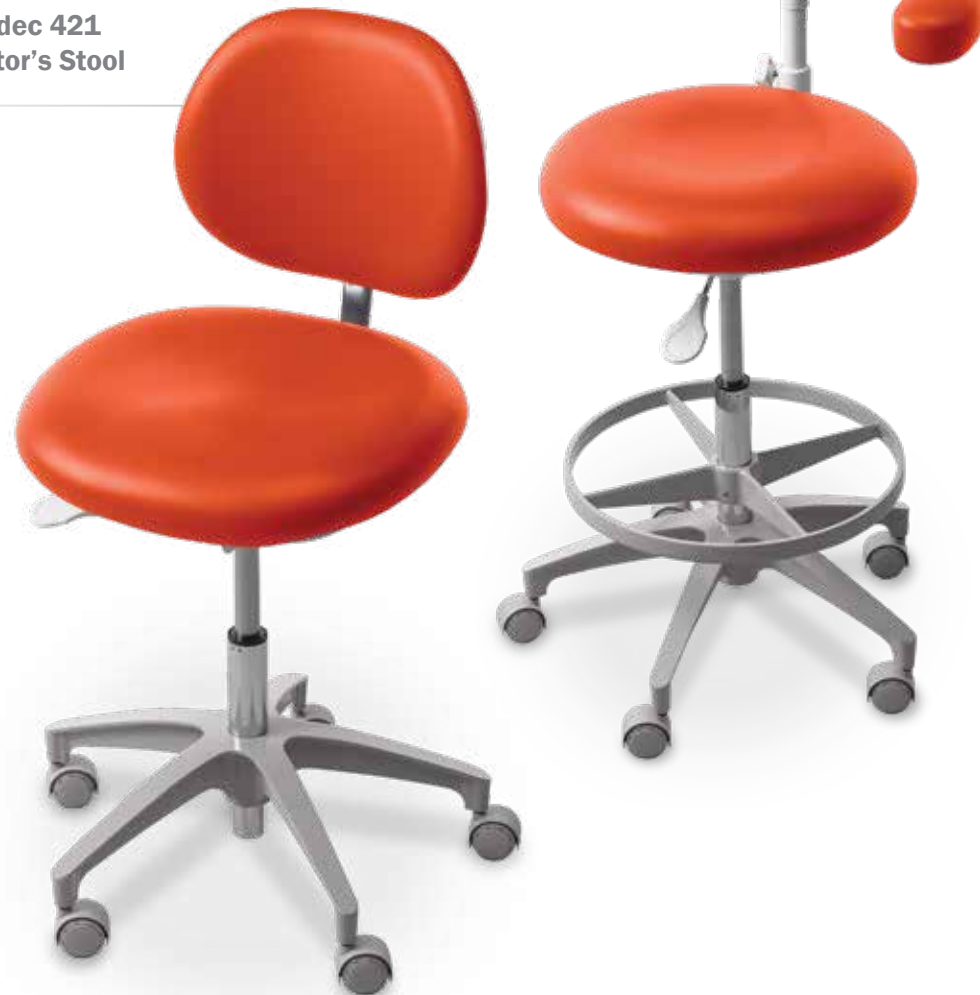
A-dec 421 Doctor's Stool

Select sewn or formed upholstery in an extensive color palette that's sure to complement your office. Make your next seating investment with A-dec—we're here to support you.