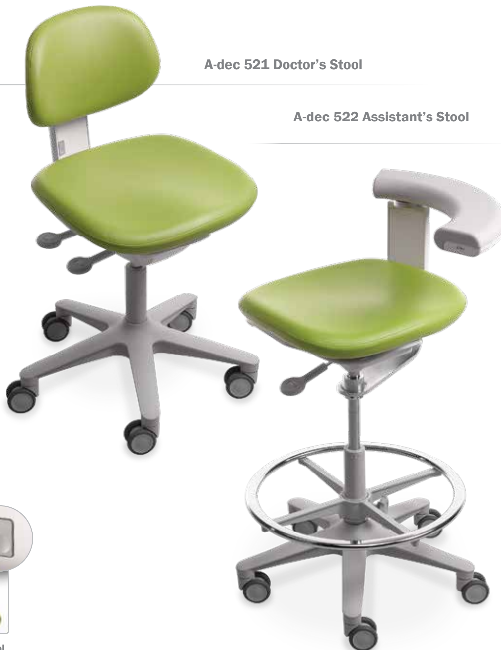
A-dec 522 Assistant's Stool