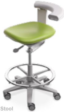
A-dec 522 Assistant's Stool