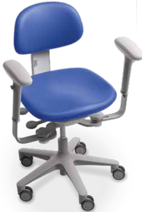
A-dec 521 Doctor's Stool with Optional Swing-out Armrests

Replaces foot ring to better distribute weight from the seat to the feet for an "athletic stance."