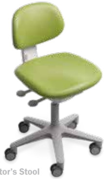
A-dec 521 Doctor's Stool