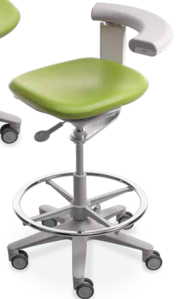
A-dec 522 Assistant's Stool