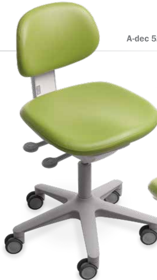
A-dec 521 Doctor's Stool

A push button makes access and one handed adjustments easy.