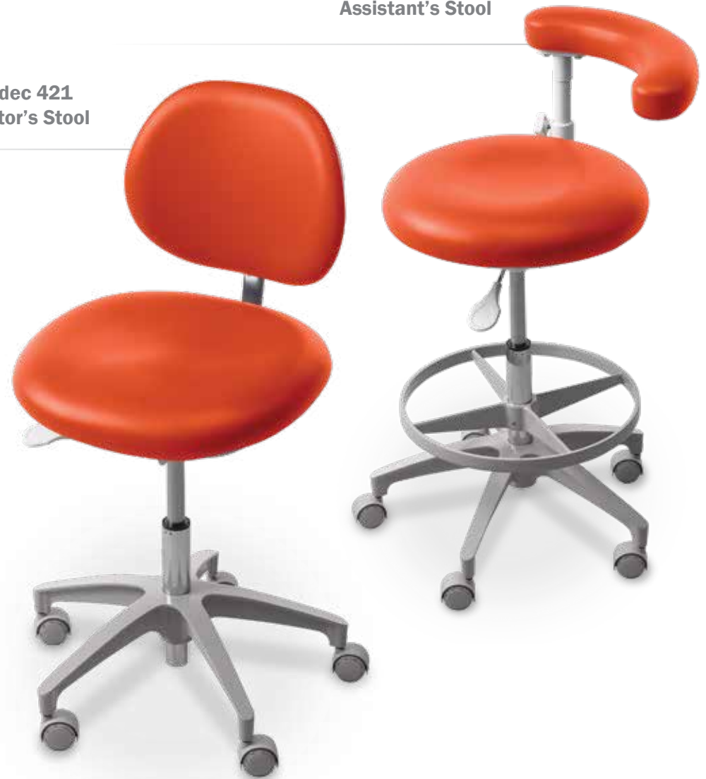
A-dec 421 Doctor's Stool

Select sewn or formed upholstery in an extensive color palette that's sure to complement your office. Make your next seating investment with A-dec—we're here to support you.