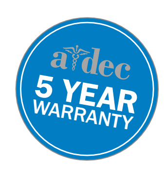
Backed by a 5-year warranty.

Everything about the premium A-dec 500 LED is designed to create optimal working conditions, like continuous light that floods the oral cavity reducing shadows and eye fatigue. A cure safe mode that gives you more time to work with composites. And a complete spectrum of colors that appear precisely as nature intended. Brilliant.