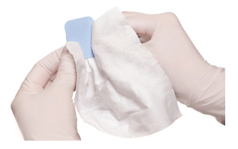
PSP Cleaning Wipes PN B8910, Box of 50