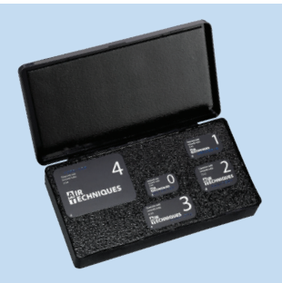
Plate Transfer Box PN 73470, Qty. 1

Size 0, PN G8610-0N, Qty. 1 Size 1, PN G8610-1N, Qty. 1 Size 2, PN G8610-2N, Qty. 1 Size 3, PN G8610-3N, Qty. 1 Size 4, PN G8610-4N, Qty. 1