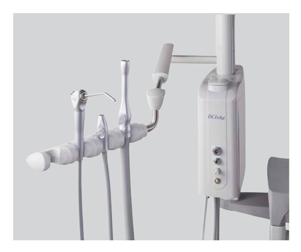
Telescoping Assistant's Package

Featuring the most reliable, ergonomic syringes and vacuum valves on the market.