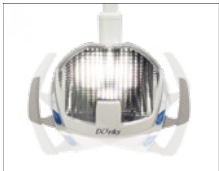
3RD AXIS ROTATION Improve lighting in all quadrants of the oral cavity.