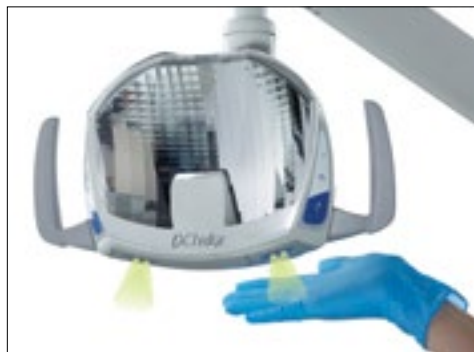
NO-TOUCH SENSORS Control the light without contact using programmable no-touch sensors.