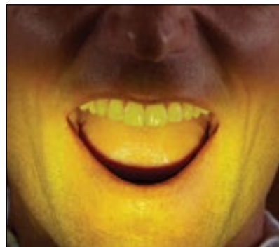
NO-CURE SETTING Filters out UV light to prolong the working time of photo-initiated resins.