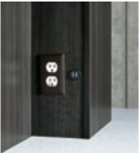
USB and electrical outlets Clock module (below)