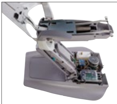
HEAVY-DUTY CONSTRUCTION High quality steel and aluminum castings stand the test of time.