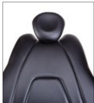
HEADREST SCOOP Headrest and back design support patients of all statures.

The Series 5 Dental Chair was designed to provide you and your team with comfortable, ergonomic access to the oral cavity. Your patients can relax comfortably, enhancing their experience at your practice.