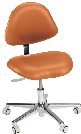
Simplicity Operator Stool