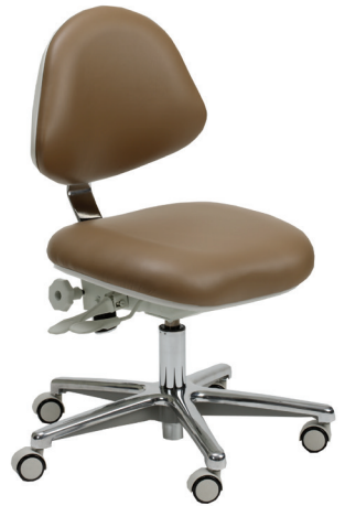
Generation Operator Stool