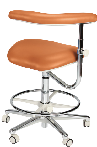
Simplicity Assistant's Stool

Dental procedures can be physically demanding, with wide, stable bases, adjustable back supports, and adjustable heights, DentalEZ Stools give users comfort. It's that simple.