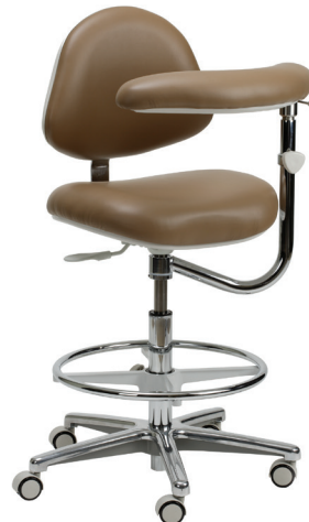
Generation Assistant's Stool