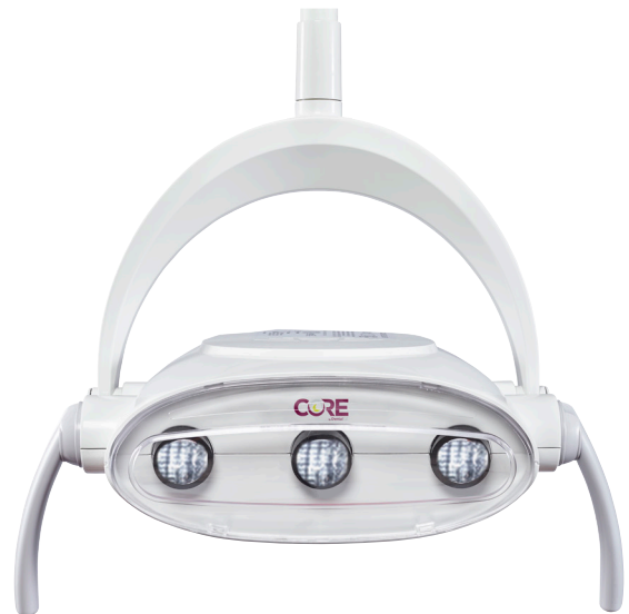
CORE LED Light

Our EverLight CRI product now features improved CRI (Color Rendering Index) that ensures more accurate color matching. It's a 23% improvement in color rendering over the original EverLight.* It's an improvement to an already trusted product.