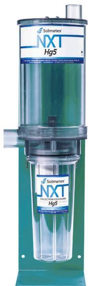
NXT Hg5 Amalgam Separator