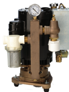
Barracuda Single Wet Vacuum