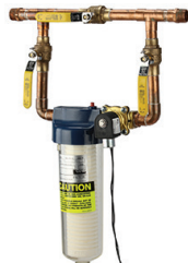
Master Water Control Valve

50% OFF Sound Cover retail in lieu of 1 premium accessory