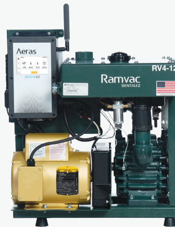
AERAS DRY VACUUM