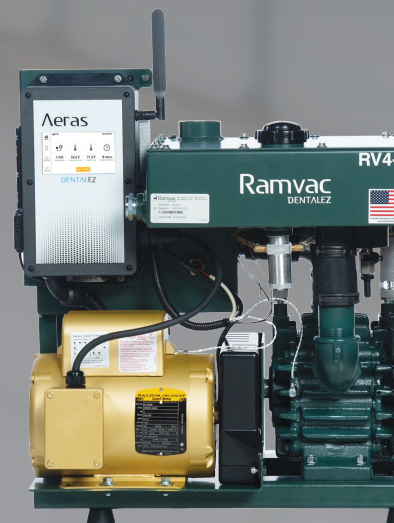
AERAS DRY VACUUM