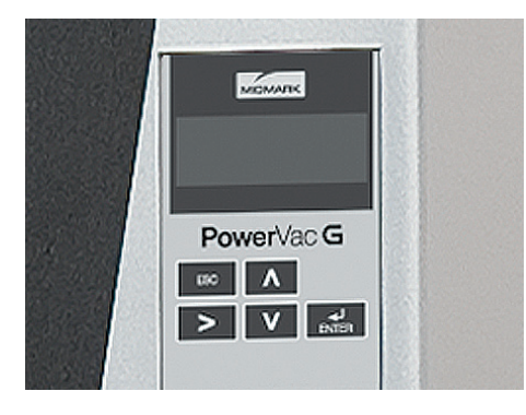
The PowerVac G control panel allows you to easily select the vacuum level that meets your needs.