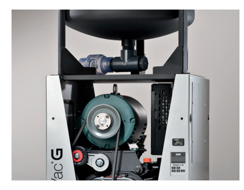
The powerful 3-HP motor can meet the vacuum demands of up to 10 users simultaneously.