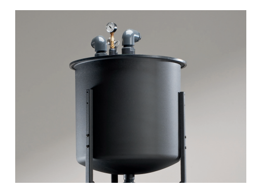
The PowerVac G has a large-volume separator to deliver the performance demanded by most practices.