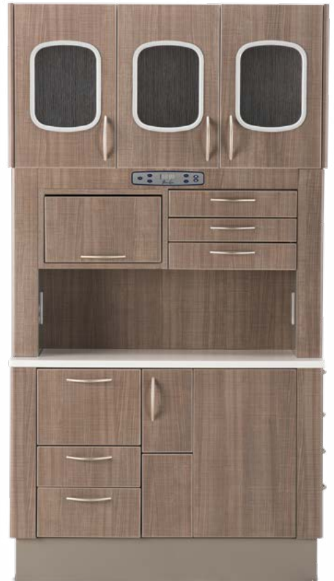
FS42-2 Shown with Extended Uppers and Optional Glass Doors