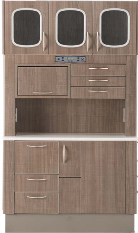
FS42-2 Shown with Standard Uppers and Optional Glass Doors