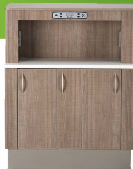
FS36B-2 Shown in Wilsonart™ 5th Ave. Elm and Frosty White Mirage