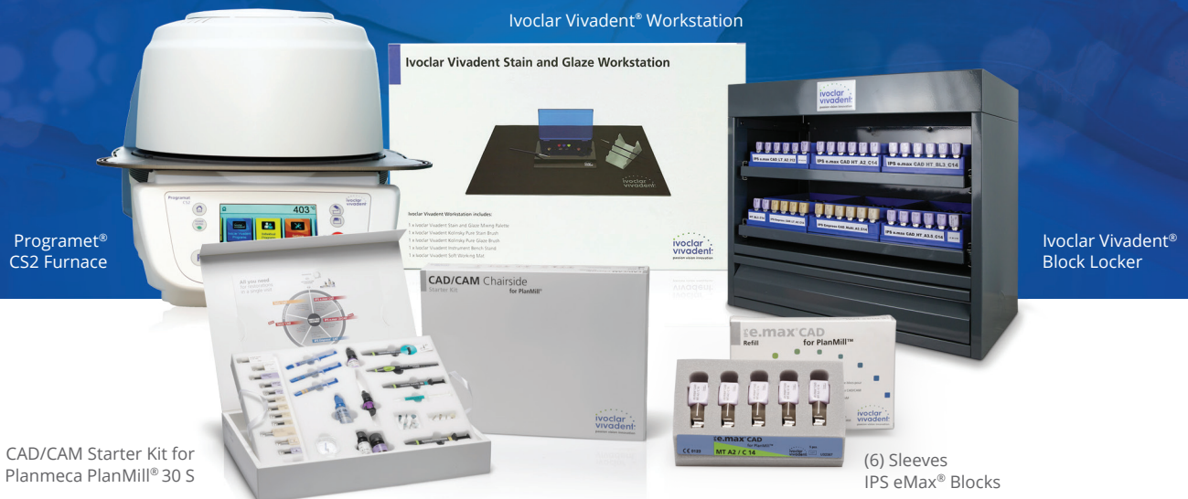
Programat® CS2 Furnace