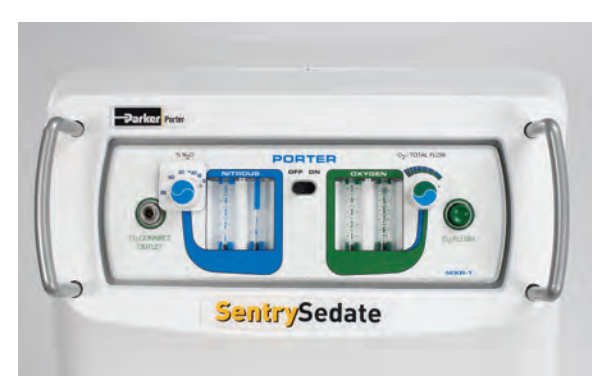
Porter MXR-1 Analog Flowmeter

Porter's newest Nitrous Oxide Sedation System features portability and security with: