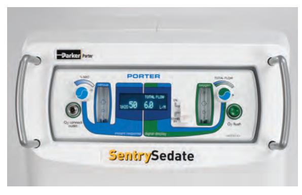
Porter MXR-D Digital and Analog Flowmeter