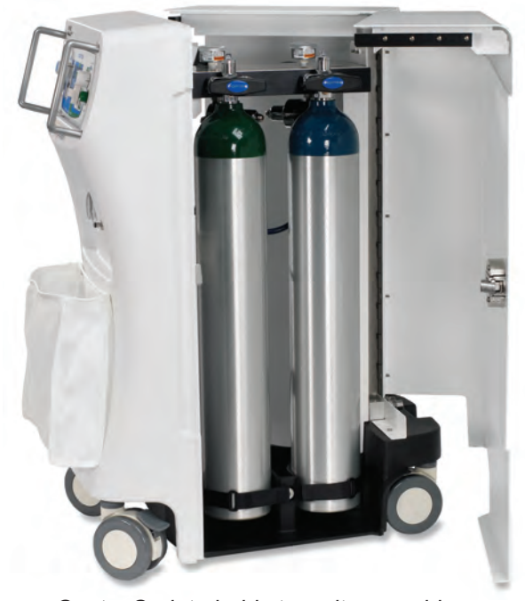
Sentry Sedate holds two nitrous oxide cylinders and two oxygen cylinders.