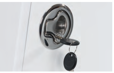
The dual locks ensure safe, secure cylinder storage.