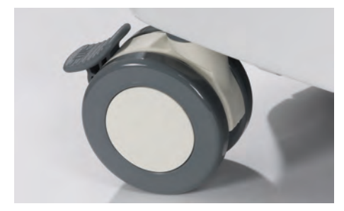
Large locking wheels allow the unit to be easily moved from room to room.