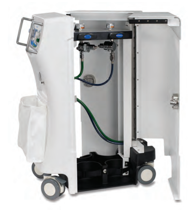
The sturdy cabinet design features both internal and external storage.