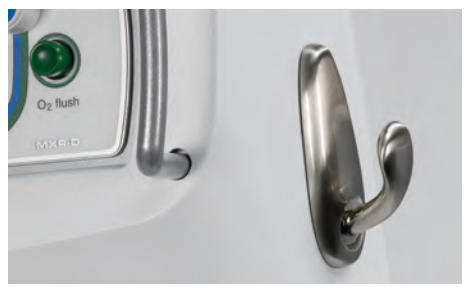
A side hook conveniently holds the breathing circuit and hoses.