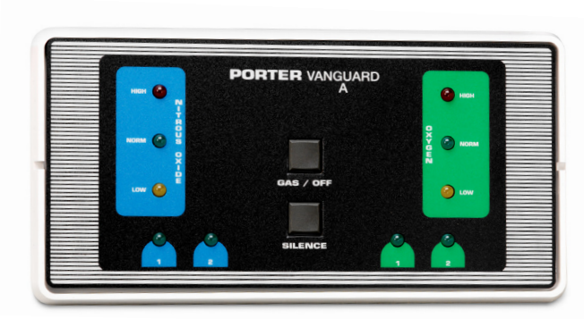
Porter Vanguard Wall Alarm Panel