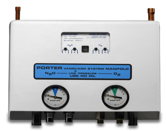
Porter Vanguard Manifold

Product Application: Manifold Gas System for Nitrous Oxide and Oxygen for Level II facility.