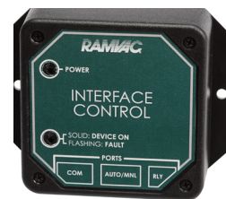
OWL Interface Control