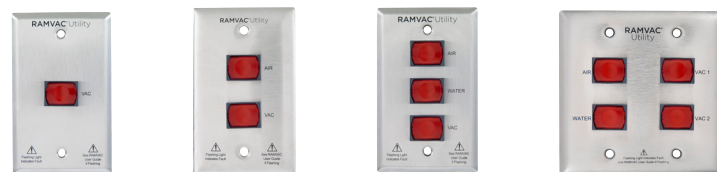
Remote Panels, choice of configuration