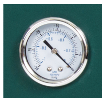
Easily monitor vacuum gauge