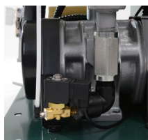
Compact design with robust pump