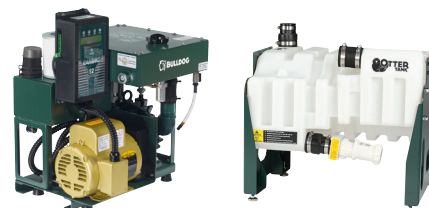
Bulldog QT alongside 15 gallon Otter Tank