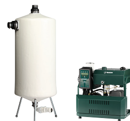
Bison alongside 50 gallon cylindrical tank