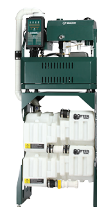
Bison shown on 30 gallon Otter Tank® using optional utility stand