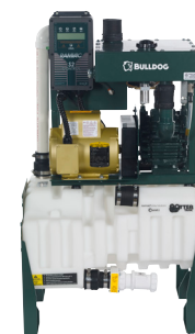
Bulldog QT stacked on 15 gallon Otter Tank