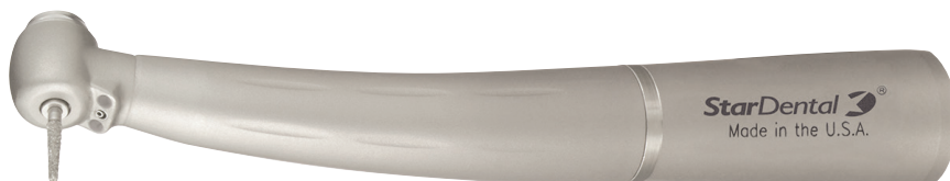
Solara QT Lightweight titanium design.