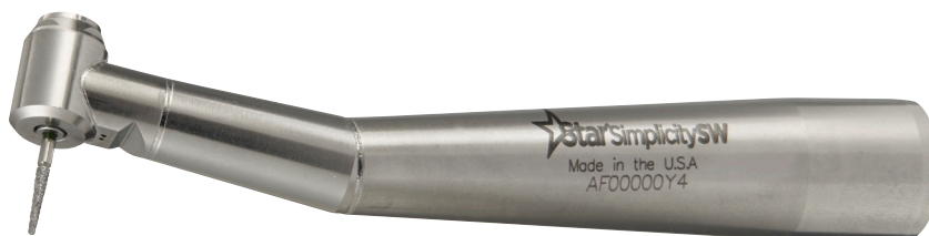
StarSimplicity Durable and economically designed.